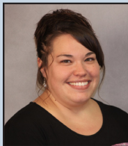
Jodale Member Service Center Rep. Caribou