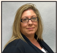
Misty Full-Time Teller Float