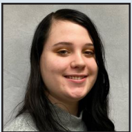
Georgia Full-Time Teller Presque Isle