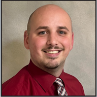
Taylor Mortgage Loan Officer Presque Isle