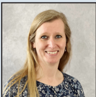
Amy MSR Card Services Presque Isle